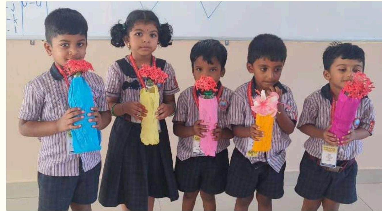
Flower Vase making, Art and Craft by LKG Tots