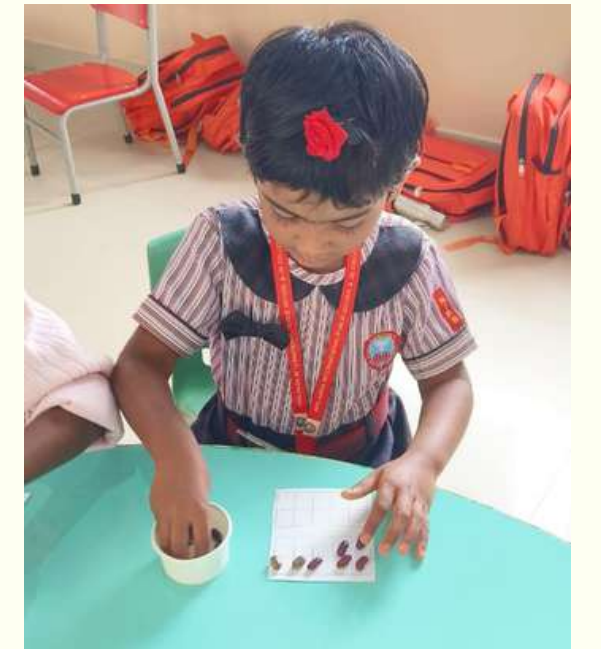
Counting Tens by Placing Beads