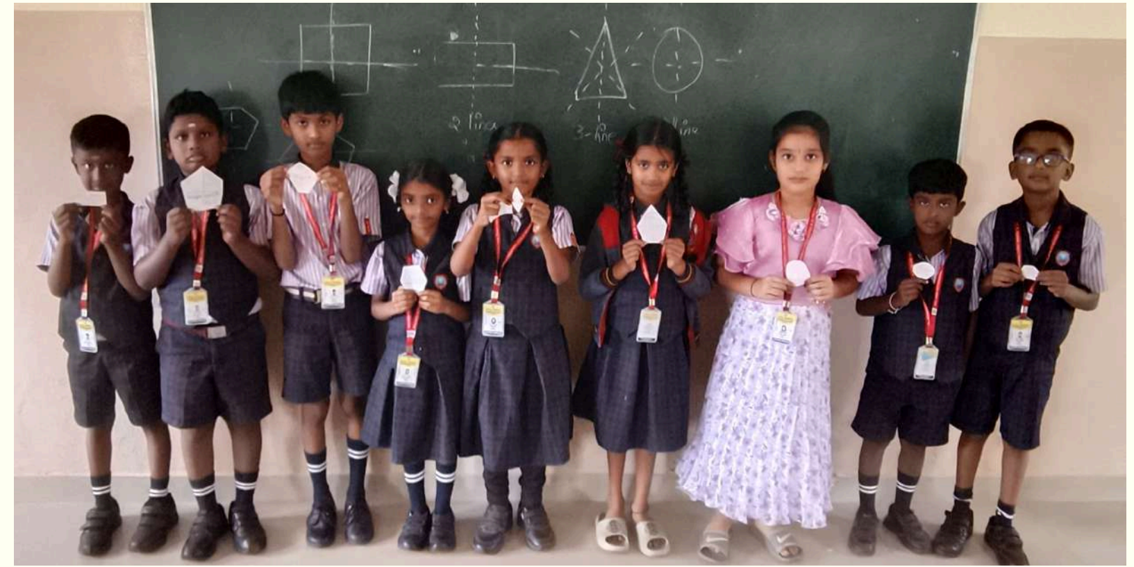
Math Lab Activity- Making Shapes and identifying its Axes of Symmetry